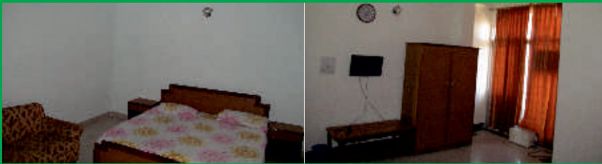
Inside views of Guest House Rooms