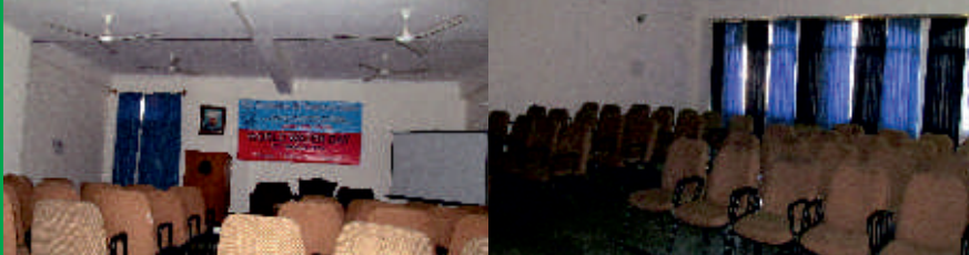
Inside views of Lecture Hall